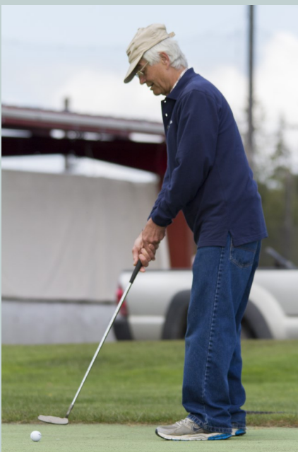
Pictured above: George Benson