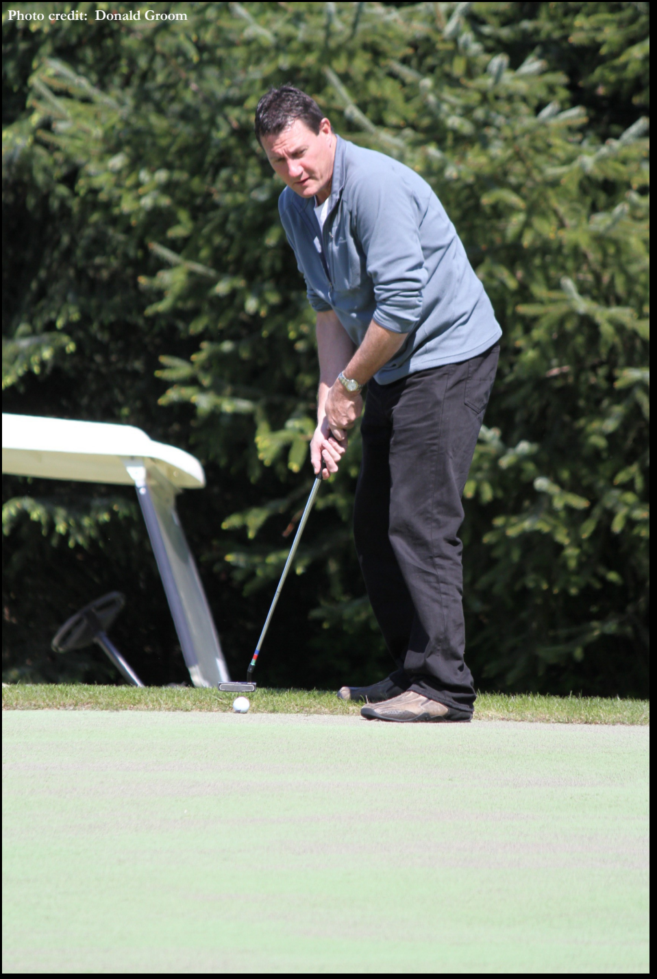
Pictured on this page are photos of golfers visiting Muskeg Meadows from the Oceania Regatta cruise ship that stopped in Wrangell, Ak several times over the summer.