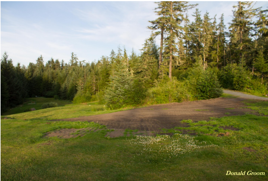
Pictured above is the current construction area on fairway #3.