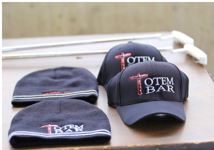
Michelob Ultra putters and Totem Bar hats were among several prize drawings for the Totem Bar's golf tournament.

The weather was cooperative and comfortable for this eighteen hole, four-person Best Ball golf tournament. The golfing crowd