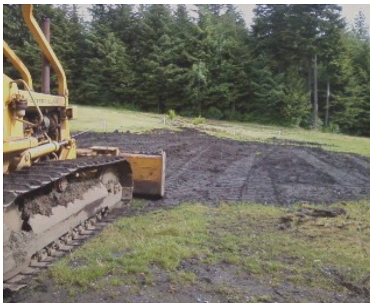
Pictured on the left is the current construction area on fairway #3. A relief is given, no closer to the pin out of this rough area. Please be advised the new tee area for men (white pegs) is just below this construction, and ladies tee area (red pegs) is just above it, making fairway #3 a short par 3.