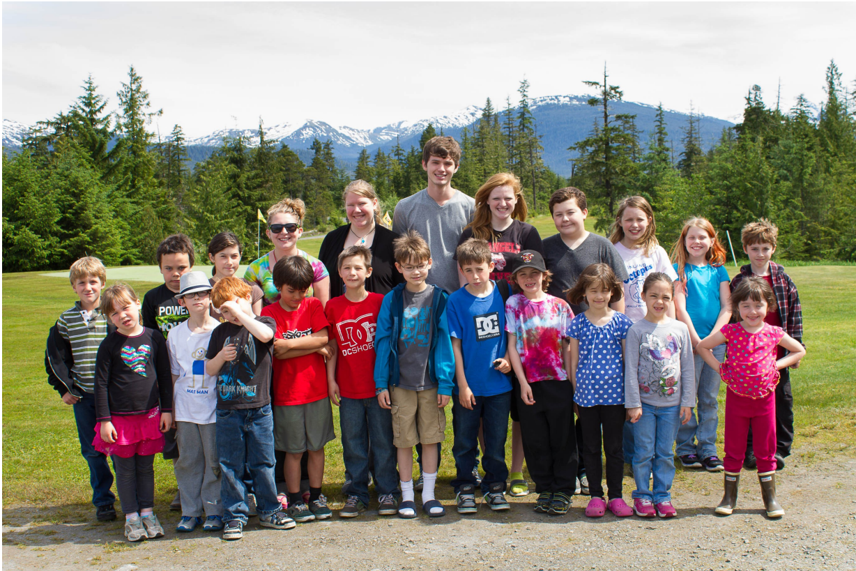
Wrangell Parks & Recs Summer Youth Program includes golf for children between 11am and 12 noon next Tuesday, July 30th.