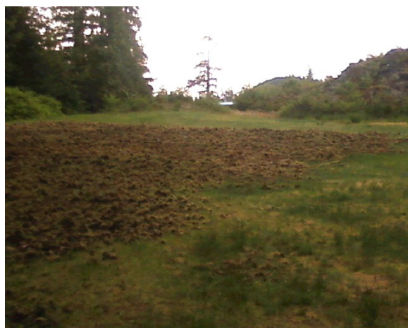
Pictured above are examples of the damaged fairways caused from ravens. ~Shannon Booker