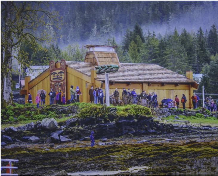
Pictured above is the Shakes Island canvas photo print by AlaskaPix.com currently being raffled at the golf course.