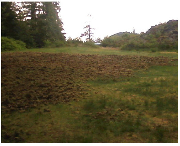
Pictured above are examples of the damaged fairways caused from ravens.

Ravens are a protected species and are considered sacred by the local natives of Southeast Alaska. The Legend of the Raven says the once white bird, now black, helped bring the sun, moon, stars, fresh water and fire. The Raven is also considered by local natives to be ancestors who are mischievous, handsome tricksters.