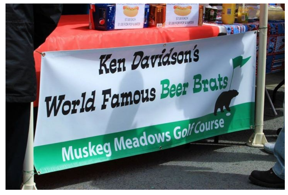
Wrangell Golf Club's Brat Booth downtown Wrangell, Alaska on the 4th of July.