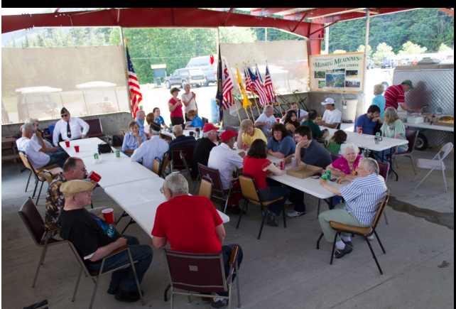
June 16, 2013 Father's Day ELKS Picnic and American Legion Flag Burning Ceremony.