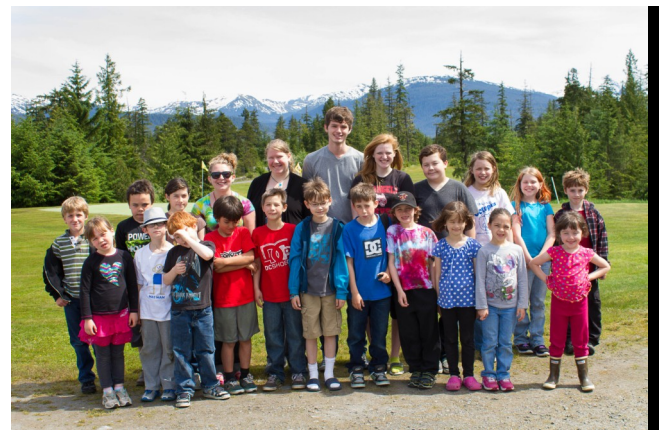
Wrangell Parks & Recs Summer Youth Program includes golf for the children between 11am and 12 noon.