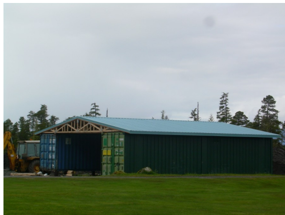
Muskeg Meadows Golf Course, Covered Motor Cart Parking area nearing phase 2.