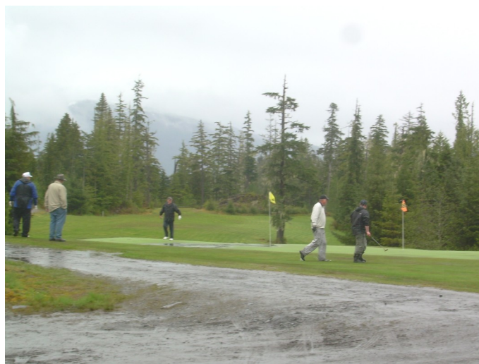
Saturday, May 18, 2013 Through heavy rain and poor course conditions one group finishes hole #9.